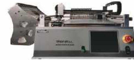
Tronstol 3V Pick and place machine