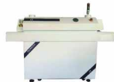
L8 reflow Oven