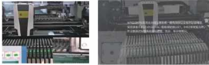
Flying 3D Laser Identification and Correction Technology Grating Full Feedback System

Using Flying 3D Laser Identification and Correction Technology, the component is scanned and recognized as picked up, and the mounting coordinate error is calibrated in real time.