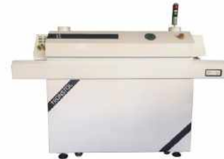
L5 reflow Oven

Solution 3: An Economical SMT Line for mass production line with 0201 accuracy and about 120 types of components