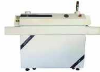
Reflow oven L8