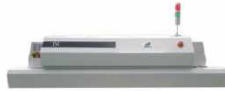
Reflow oven D5

Chain type transmission way. Speed adjustment is controlled by automatic electronic analog switch, which sensitivity no more than 1 degree, control accuracy \pm 10\text{mm}/\text{min} .