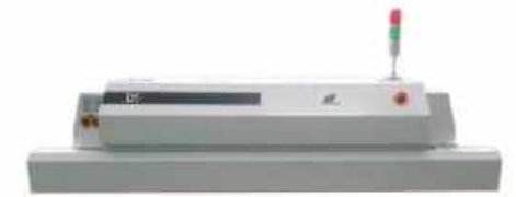
D5 reflow Oven

Solution 2: An Economical SMT Line for Small Production with 0201 accuracy and about 60 types of components