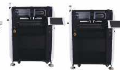
Tronstol A1 Pick and place machine