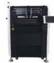
Tronstol A1 Pick and place machine