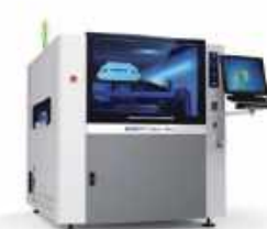
Automatic printing table

Solution 3: An Economical SMT Line for mass production line with 0201 accuracy and about 120 types of components