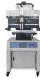
Semi-automatic printing table

Solution 2: An Economical SMT Line for Small Production with 0201 accuracy and about 60 types of components